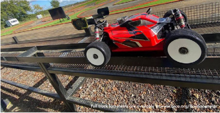
Full track fact-sheets are available at www.brca.org/brca-documents